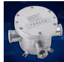
ZAJXD4 JUNCTION BOX